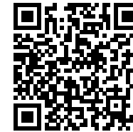
or visit www.vimeo.com/149271634